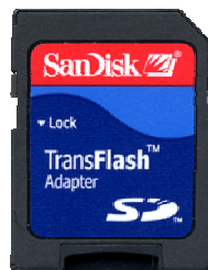
Figure 3: SD adapter (scale 1:1)

All devices which support SD cards can support microSD/TransFlash™ with the SD card adapter which is often included in the packages.