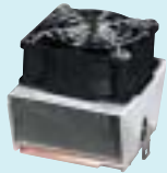
CF-513 Copper base high performace cooling fan (Ordered seperately)