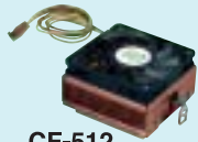
CF-512 High performace cooling fan (Ordered seperately)