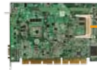
CF type I/II Solder Side