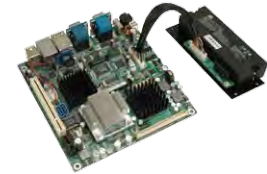
IEI motherboard with AUPS sub-system kits