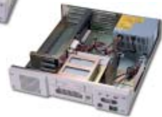
RACK-210G Top View