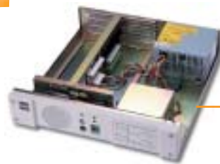
RACK-200G Top View