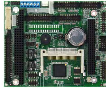
ETX form-factor development kit: Matches the footprint of the ETX-N270 and provides connectors for system I/O, CompactFlash, PC/104-Plus expansion, two additional serial ports, RS-232/422/485 buffering, a digital I/O port, and a second Ethernet LAN interface.