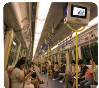
Multimedia / Digital Signage